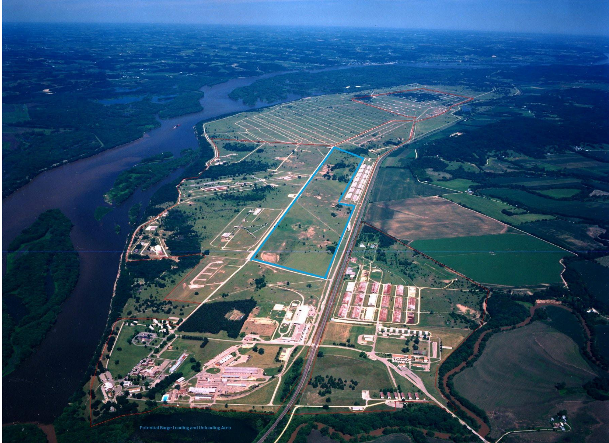
Potential Barge Loading and Unloading Area